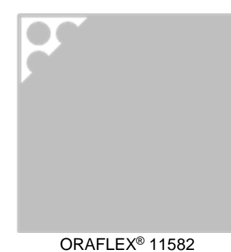
ORAFLEX<sup>®</sup> 11582 firm