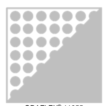
ORAFLEX® 11655 medium